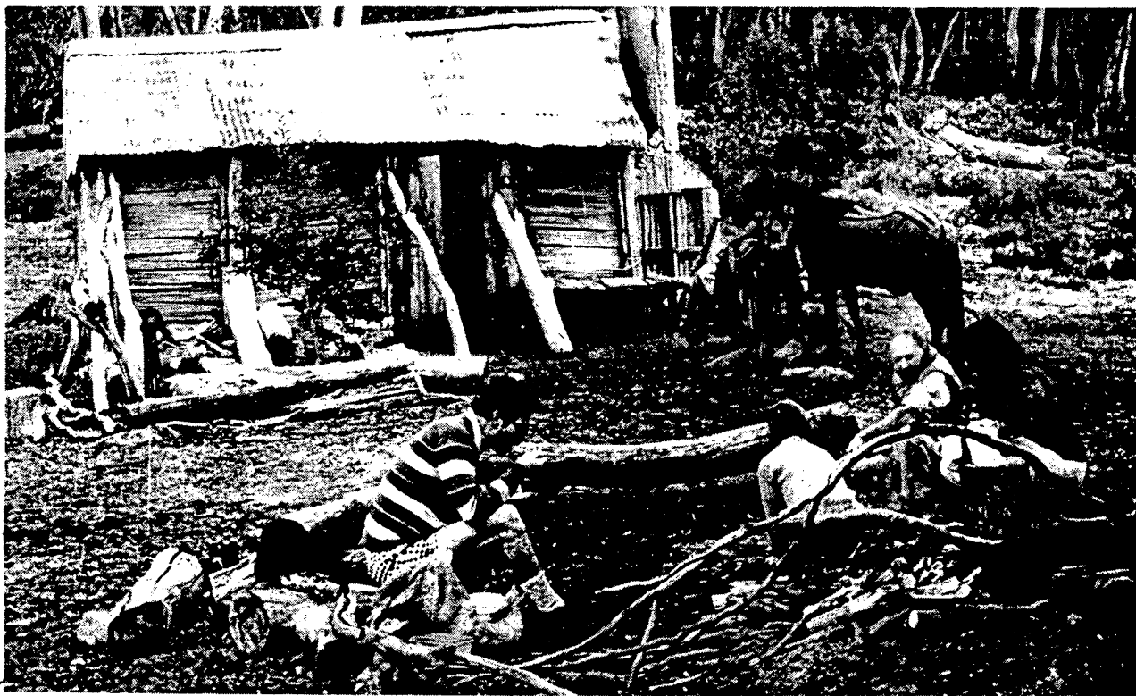
Some of the N.P.A. packwalkers at breakfast in front of Cascade Hut on a recent outing