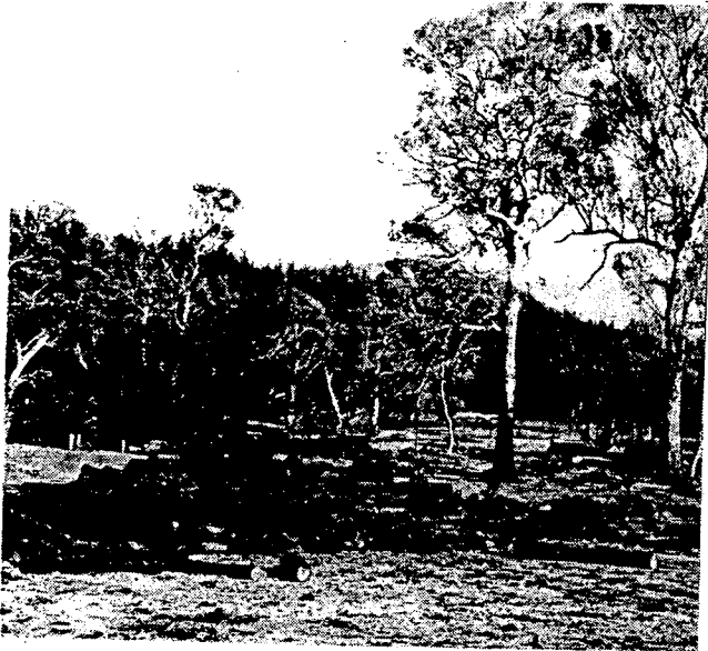
Burnt pine logs cut from the Boboyan forest after the Gudgenby fire