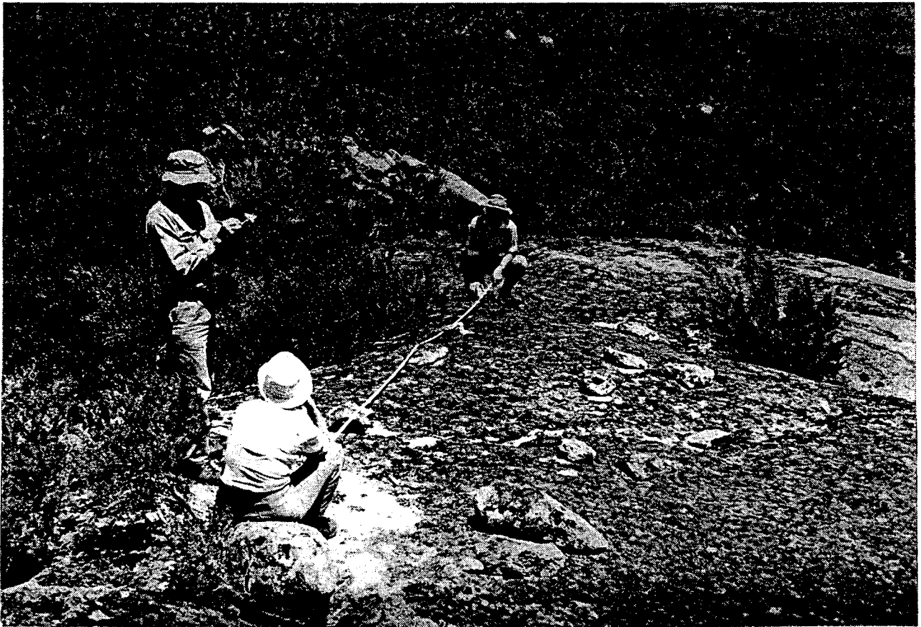
N.P.A. members measuring-up on Coronet Peak preparatory to making a plan of the Aboriginal stone arrangement there