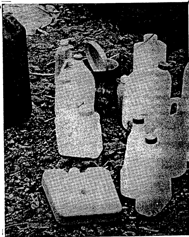
Containers of water carried by members to the top of Mt Boboyan to make tea and coffee for the public on the Heritage Week walk