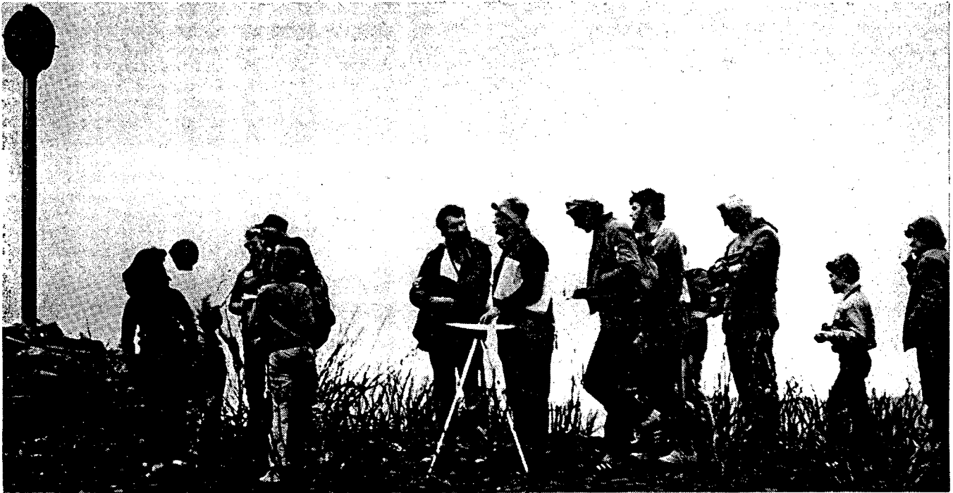
Members of the public and N.P.A. members on top of Mt Boboyan during the Heritage Week Walk