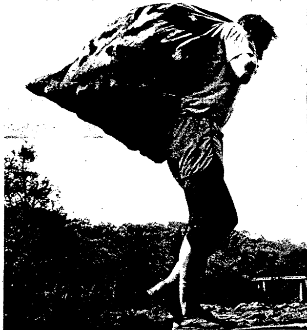
Assorted cans and bottles gathered during the February swim/walk up the west bank of the Murrumbidgee above the Cotter confluence